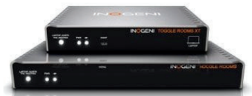
Inogeni Toggle Rooms XT, USB/HDMI-3 Host Switcher with Extension