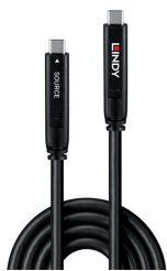
43398 - 10m USB 3.2 Gen 2 & DP 1.4 Type C Fibre Optic Hybrid Cable