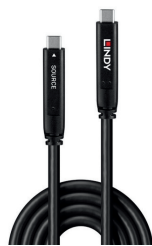
43399 - 15m USB 3.2 Gen 2 & DP 1.4 Type C Fibre Optic Hybrid Cable