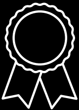
RELIABLE MEDICAL SYSTEM