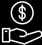
COST EFFECTIVE SOLUTION