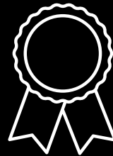
RELIABILITY & DISTANCE