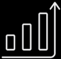
IMPROVED MEETING EFFICIENCY

Pairing Neat's intuitive collaboration devices with Lindy's high-performance USB-C and HDMI connectivity solutions delivered significant functional and aesthetic improvements. The integration enabled clean and efficient AV setups with seamless device performance, regardless of room size or configuration. Installations were simplified through Lindy's plug-and-play infrastructure, reducing the need for complex cabling or technical troubleshooting. The result was a streamlined user experience and visually polished meeting spaces free from excessive cable clutter. Together, the solution provided a stable, future-ready collaboration environment that supports both in-person and hybrid working models.